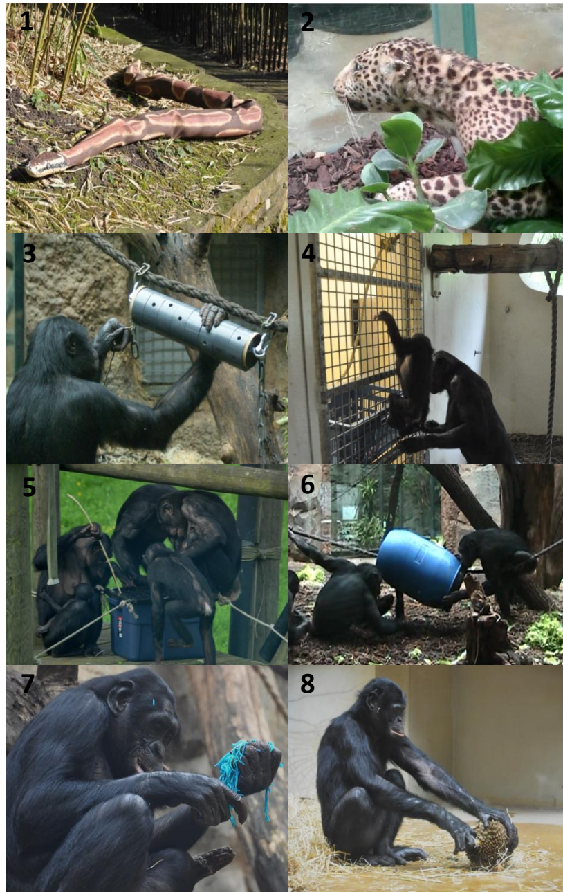
Figure 1. Behavioral variables from eight experiments were collected to assess their association with rated personality traits. Bonobos were tested in three different experimental contexts: Predator experiments included a fake python (1) and taxidermied leopard (2). Puzzle feeder experiments included turning tubes puzzle (3), reel and feed puzzle (4), Barrel with mesh puzzle (5) and hanging barrel puzzle (6). Novel food experiments included blue dyed pasta (7) and durian fruit (8).