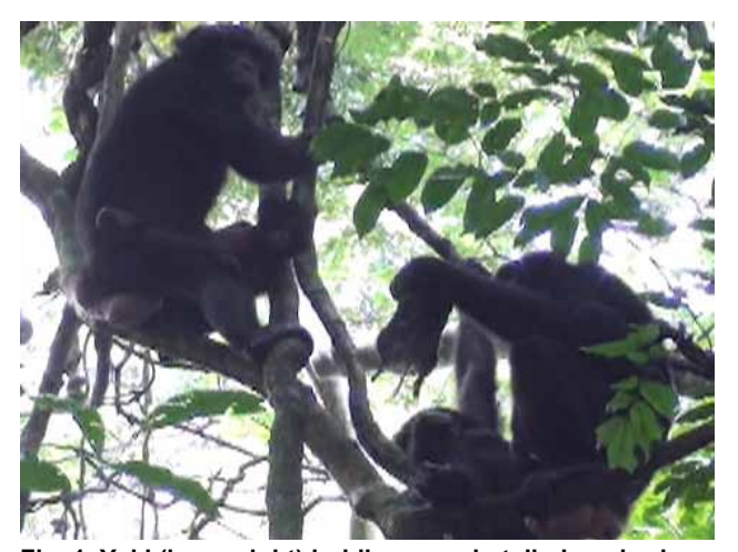
Fig. 1. Yuki (lower right) holding a scaly-tailed squirrel and Hoshi (upper left). Both of them had dependent offspring.

While Hoshi stayed within reach of Yuki, Hoshi showed begging behaviors 14 times. All of these resulted in the transfer of a part of the junglesop from Yuki.